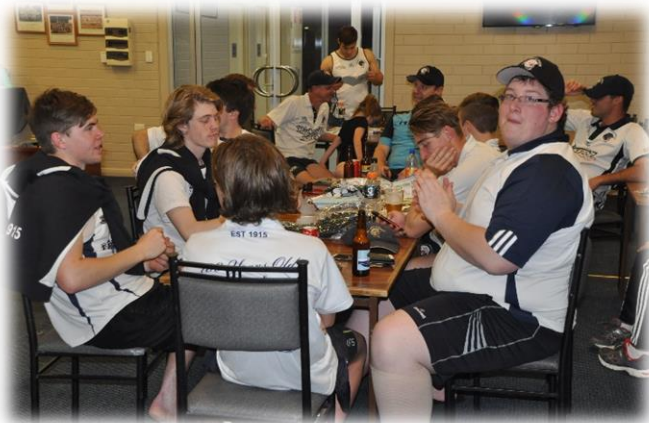
Good numbers at selection night!