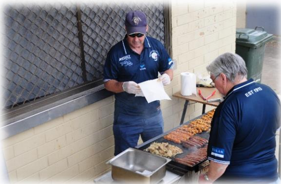
Tongs of Fury!!