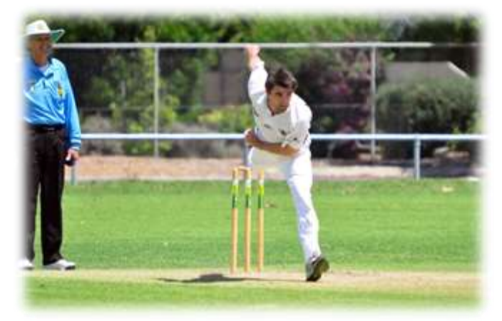
Blackie in action