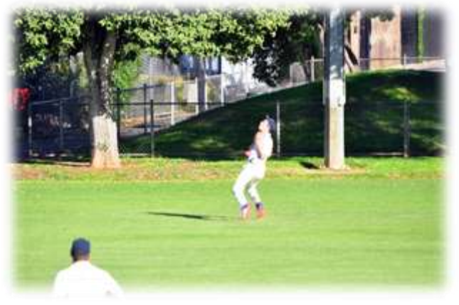
Question did Tom (GPS) catch this ball?