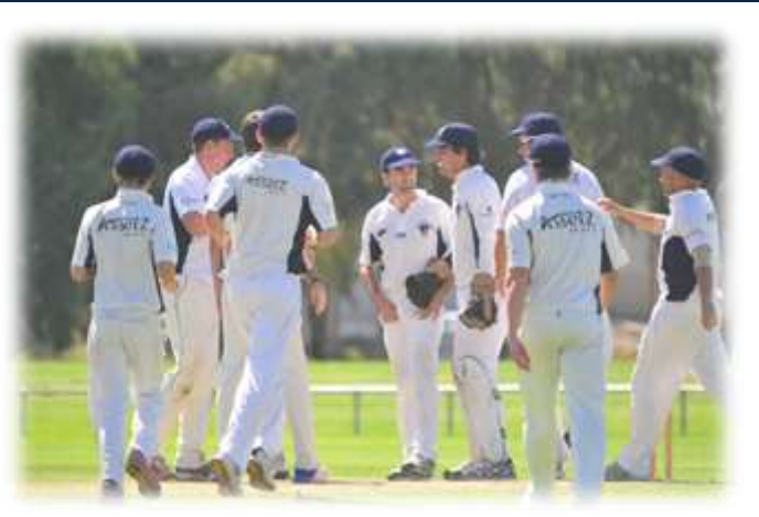
A grade gather after another Grange wicket falls