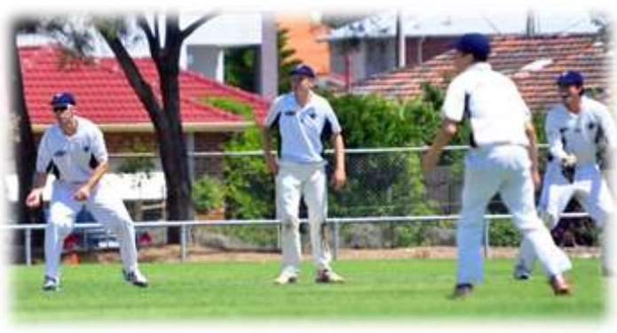
shouts of catch