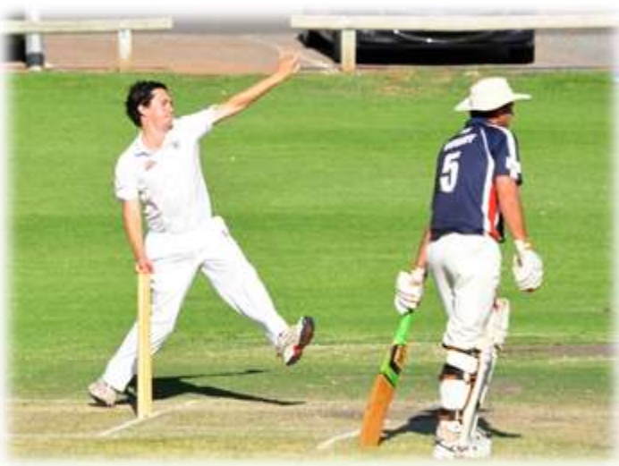
Hyphen sending down a thunderbolt

Baz rolling the arm with another straight break