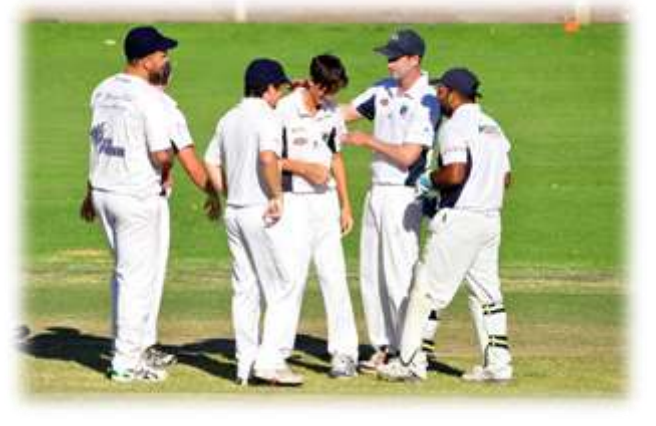
The 20/20 B grade celebrate a ball that turned!