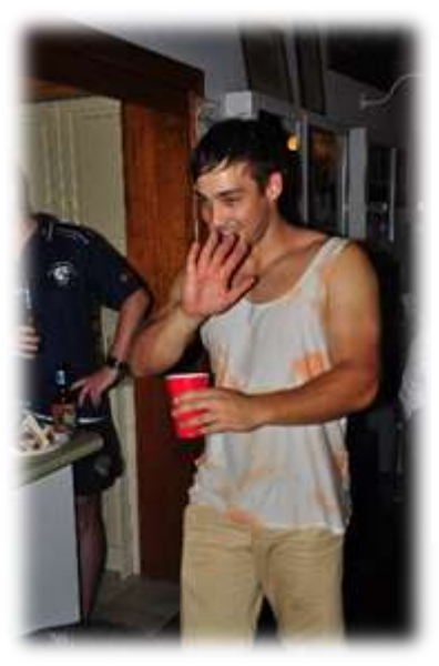
Ignore the stains, it makes the shirt look trendy